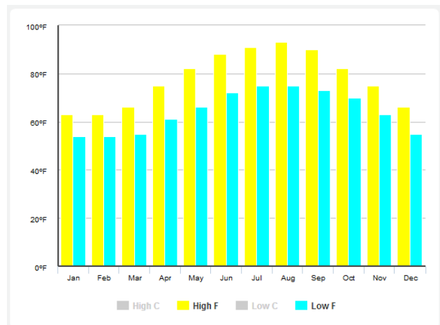
Dead Sea & Tiberias